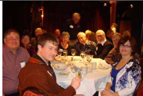
Figure 4 Table of Orion and Phantom crew