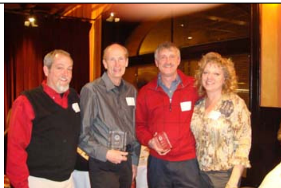
Figure 6 This is the crew of Cool Change