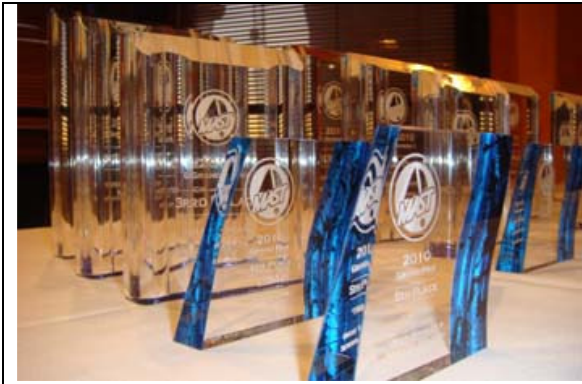
Figure 1 Awards